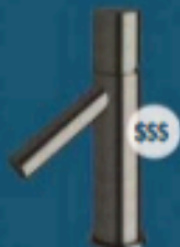
Milli 'Pure' basin mixer in Brushed Gunmetal, $737, Reece. 6-star WELS.